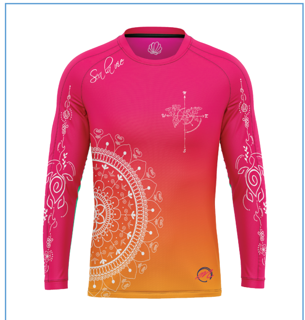
CUSTOM RASHIE - LONG SLEEVE LPF50+