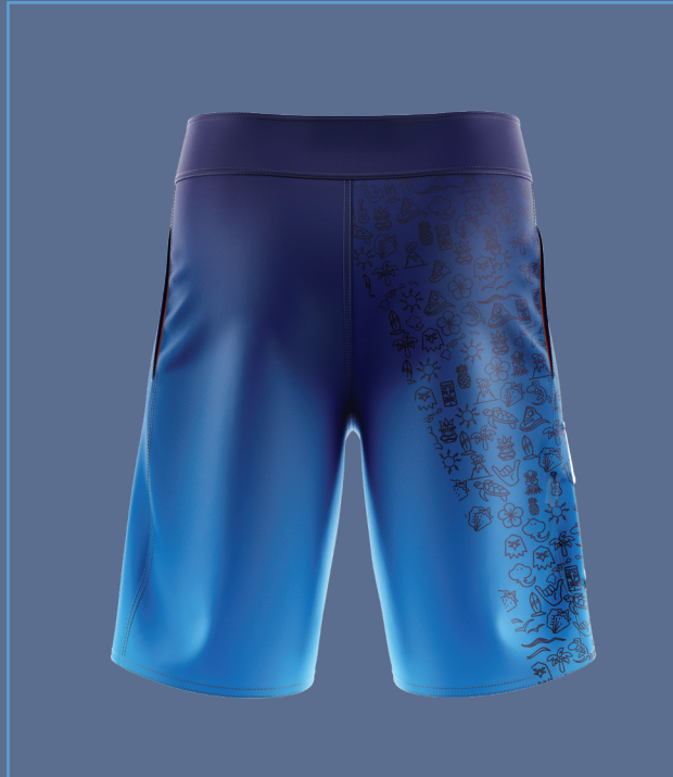
CUSTOM BOARD SHORTS