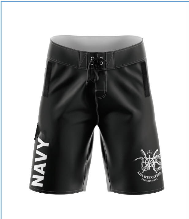
CUSTOM PADDED DRAGON BOAT SHORTS