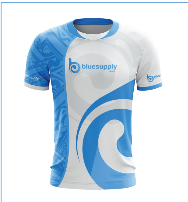
CUSTOM RASHIE - SHORT SLEEVE LPF50+