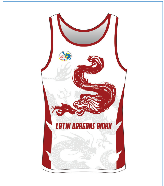
CUSTOM RASHIE - RACERBACK LPF50+