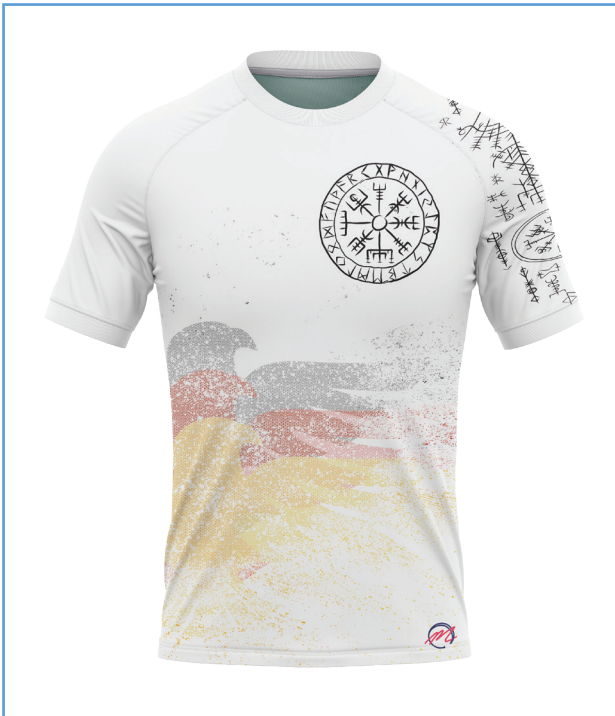
CUSTOM SOCIAL/TRAINING JERSEY 100% POLYESTER