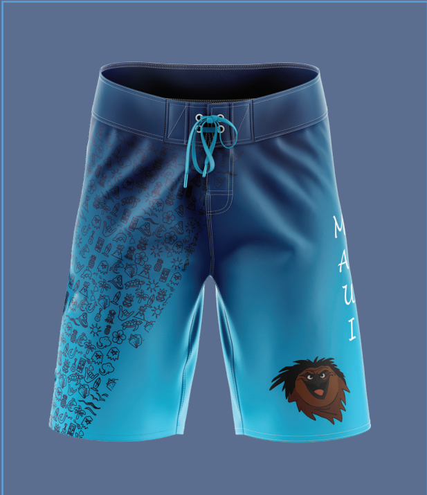
CUSTOM BOARD SHORTS